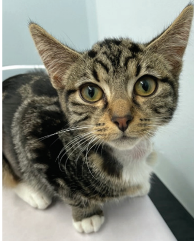
Figure 8. The same domestic shorthair cat with dry FIP just 4 weeks into treatment with remdesivir.

develop mediastinal lymphoma, and 1 kitten was put to sleep for presumed septicaemia. The other cases are at various stages of remission or still in treatment.