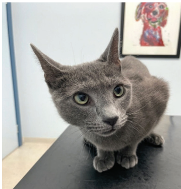
Figure 1. A 1-year-old M(N) cat who was originally diagnosed with lymphoma. The cat presented with enlarged mesenteric lymph nodes, enlarged liver, jaundiced, low albumin and high globulin and was subsequently diagnosed with dry FIP—now over 6 months in remission after completing 84 days of remdesivir. He was diagnosed based on his response to remdesivir.

medicine, behavioural medicine and feline welfare. She has gained a keen interest in feline imaging—especially abdominal ultrasound. She finds shelter medicine particularly rewarding which is strengthened by Concord Veterinary Hospital's strong association with The Cat Protection Society of NSW.