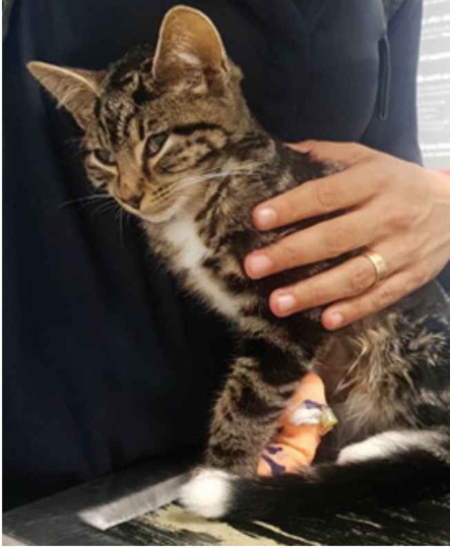
Figure 7. A M(N) 12-week-old domestic shorthair with dry FIP – they generally just look ‘poorly’ with a fever that persists.