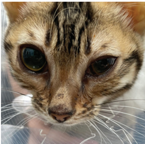
Figure 5. A F(S) Bengal cat with ocular and central FIP before treatment with remdesivir. Note the dilated pupils. This cat was centrally blind prior to treatment.

Treatment with remdesivir is for 84 days by subcutaneous injection, so it requires a committed owner or a sympathetic veterinarian geographically close by. Remdesivir can be sourced readily from BOVA Compounding Pharmacy who ship Australia-wide normally overnight. The cost of the drug is significant; the vials are 100mg/vial at $275/vial inclusive of GST. The final concentration is 10mg/mL. Needless to say—treatment of FIP by an owner takes a lot of financial and emotional commitment.