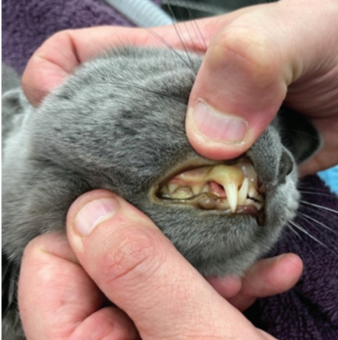
Figure 2. A cat with wet FIP presenting with severe jaundice and anaemia.

enlarged mesenteric lymph nodes, enlarged liver, changes to the kidneys on ultrasound, pulmonary granulomas, and central and ocular signs if there is a neurological or ocular component such as uveitis, blindness, and seizures.