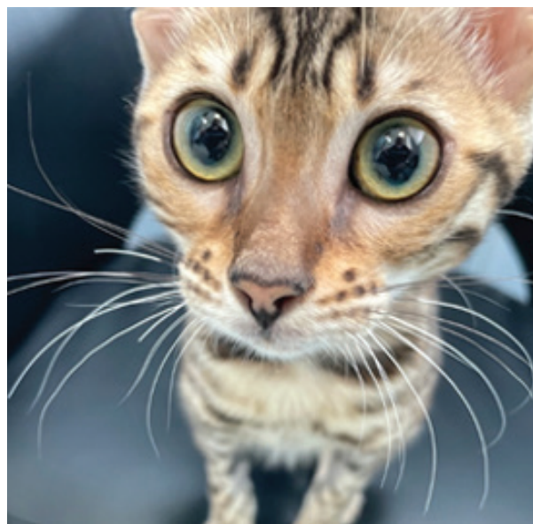
Figure 6. The same Bengal some 4 – 6 weeks later after treatment with remdesivir with a normal ocular exam and apparent full vision.

The downside to administering remdesivir intravenously is obviously having to hospitalise the patient, the added expense to the owner which is not insignificant and also there is an increased risk (10% risk) of developing or worsening of a pleural effusion with the use of intravenous remdesivir,