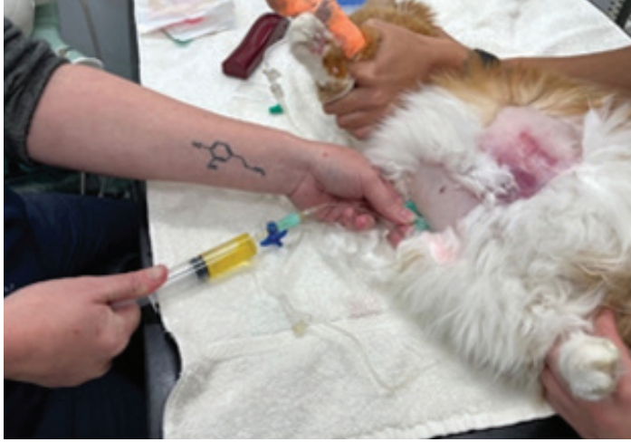
Figure 4. Collecting abdominal fluid from a wet FIP patient to submit a sample for immunofluorescence assay to VPDS, SSVS.